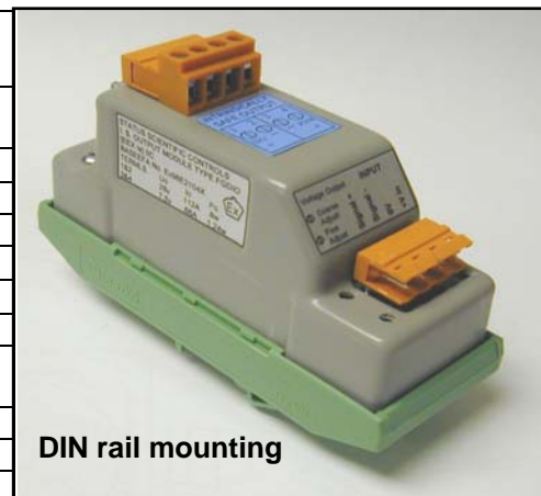
DIN rail mounting